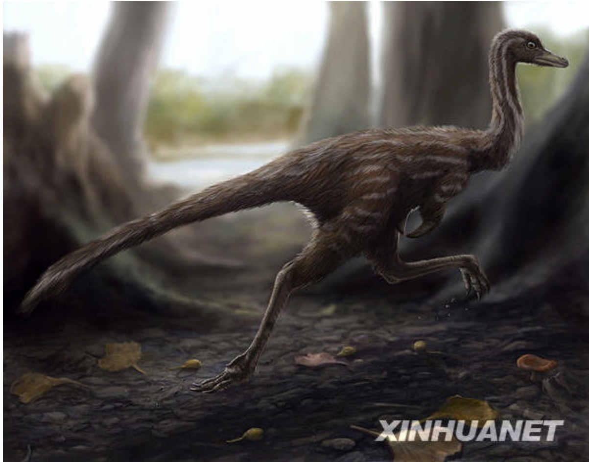
Reconstructed Mononykus Dinosaur.